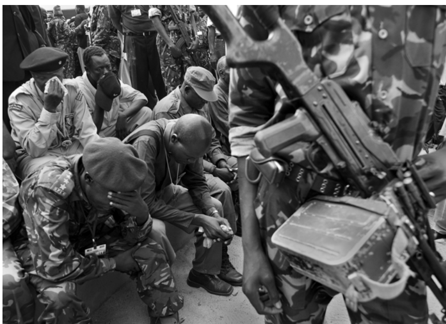
SPLA soldiers mourn during the funeral of former Sudanese vice-president and SPLA rebel leader John Garang in Juba, August 2005.

The North–South conflict formally ended with the CPA on 9 January 2005. The CPA was signed by the ruling National Congress Party (NCP) and the SPLM/A 5 and signaled a historic compromise: the government in Khartoum was guaranteed Sharia law in the North while the South gained the right to self-determination after an interim period of six years. With its provisions for a permanent internationally monitored ceasefire,